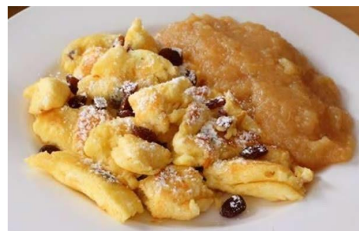
Kaiserschmarrn – fluffly shredded pancake