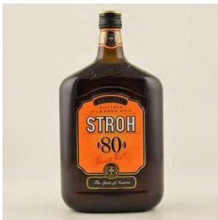
Stroh 80 – a BESTVienna tradition. We will do fun stuff with this one :D