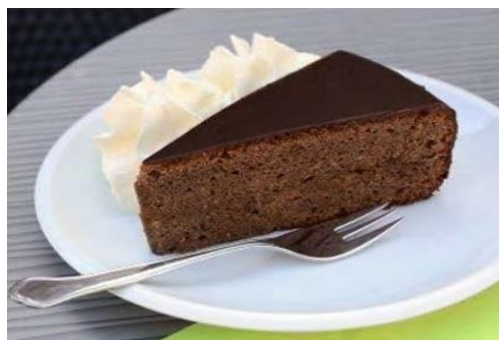
Sachertorte – chocolate cake with apricot jam