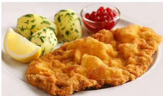
Schnitzel – (mostly veal) meat coated with flour, eggs and bread crumbs, then fried