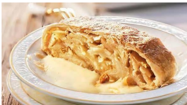
Apfelstrudel – strudel from apples with vanilla sauce