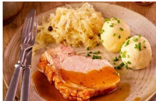
Schweinsbraten – grilled / stewed pork with dumplings and Sauerkraut